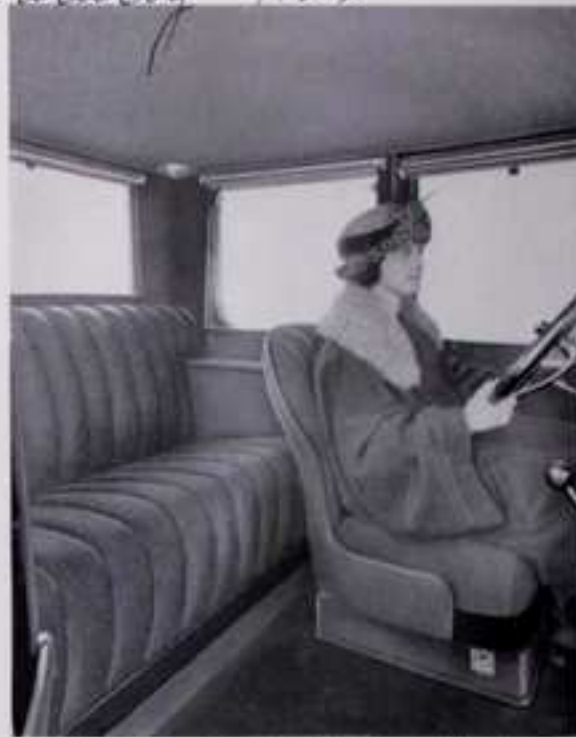
With the auxiliary seat folded forward the large rear seat is easily accessible

Wherever you may travel in the United States, Hudson service will be near. And it will be that type of service which has learned from long experience the best methods of keeping Hudsons at their best.