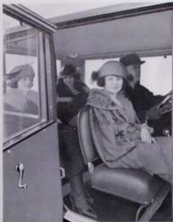
The Super-Six Coupe is an exceptionally roomy and comfortable four-passenger car

THERE IS AMPLE ROOM for two on the wide and spacious rear seat, with deep, restful cushions. The driver's seat is separate. To its right is a strong comfortable folding seat facing forward for the fourth occupant. The upholstery is a rich fabric in accord with the other appointments of this beautiful Hudson closed model. Its distinctive style and luxuriousness makes a special appeal to the lady motorist.