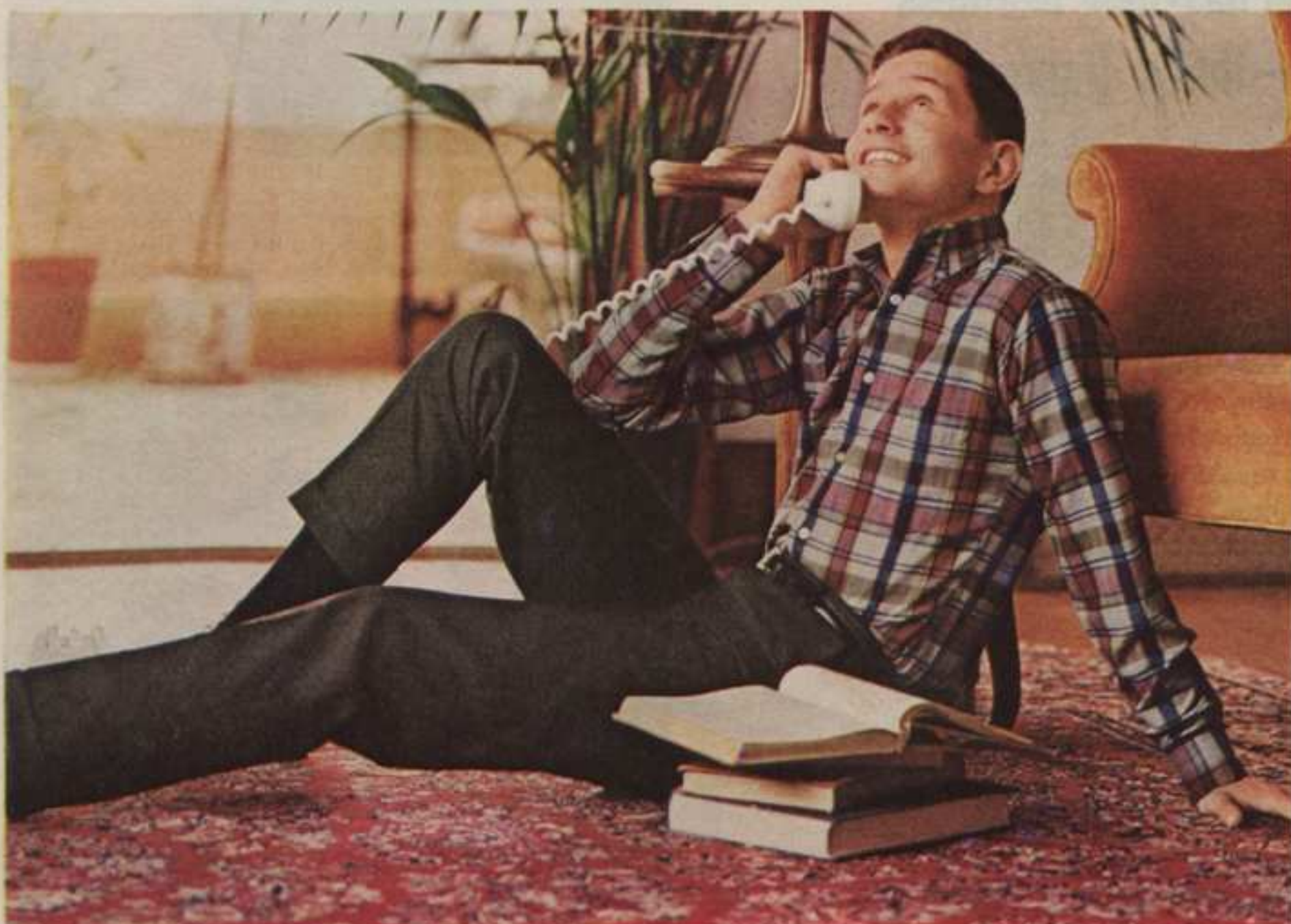
Neatness is built into this boys' sport shirt by Model®. 65% "Dacron" polyester, 35% combed cotton, about $5; likewise the slim, Ivy-styled Kalamazoo slacks of 65% "Dacron" polyester, 35% combed cotton, about $7.