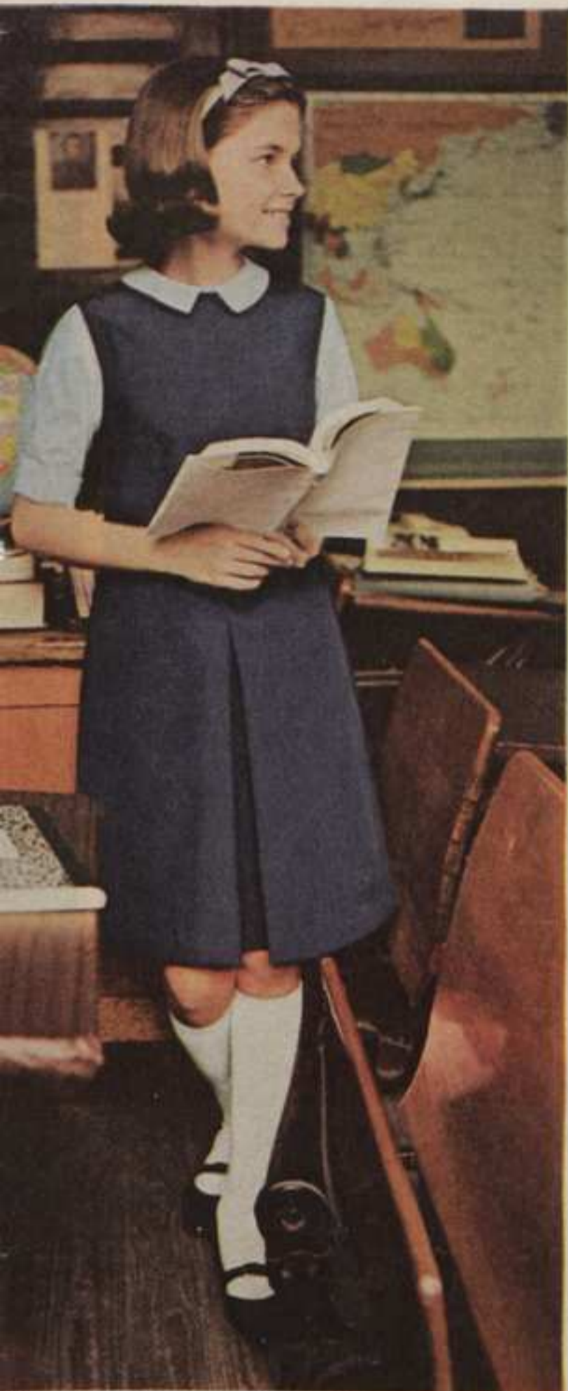
The classic jumper in poplin with a neat little blouse of broadcloth. They're 65% "Dacron" polyester, 35% combed cotton. The jumper in blue mix, red leather or heather green. About $8. The blouse in light blue, pink or green. About $4. Both by Russ for the Girl. Both in sizes 7-14.