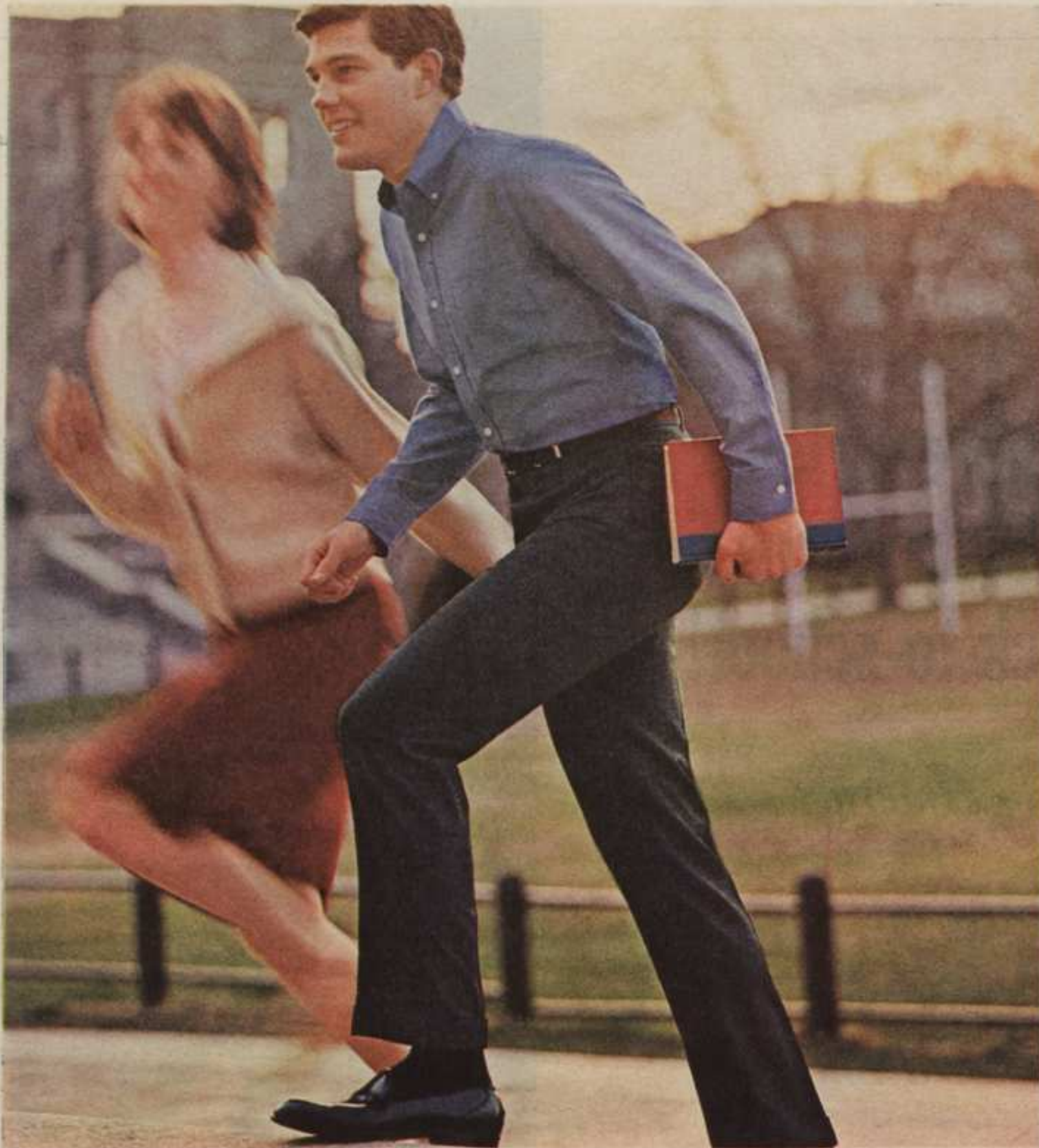
These Ivy slacks not only stay neat and sharply creased — but also stretch for great new comfort-in-action. They're Mr. Leggs slacks of "Dacron" polyester, worsted wool and "Lycra"® spandex. About $19.95.