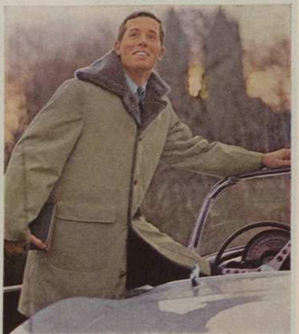
The collar of this all-weather coat by Mighty-Mac® unfolds to make a hood! Stay-neat poplin of 65% "Dacron" polyester, 35% combed cotton, lined with warm pile of "Orlon"® acrylic. About $55.