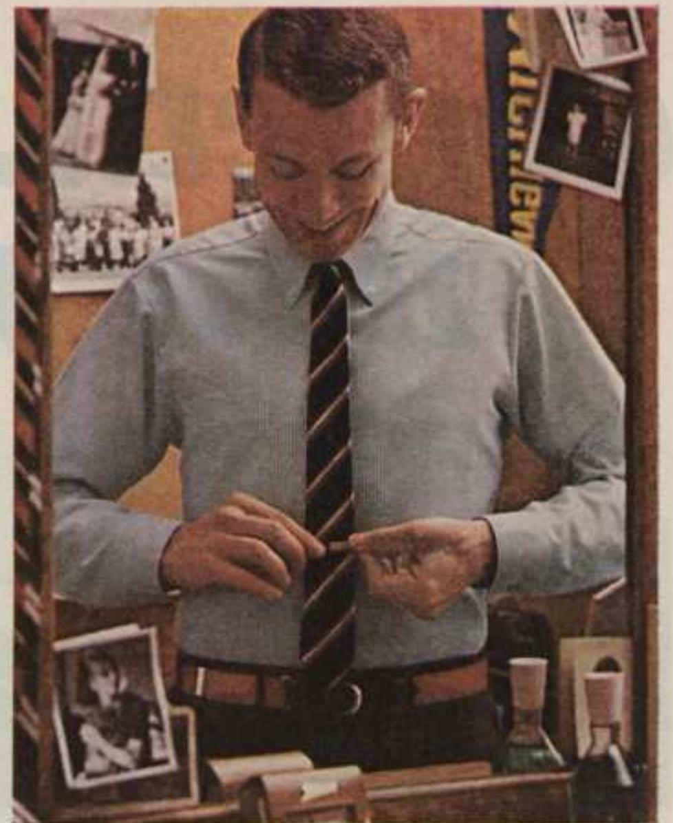
Striped button-down by Arrow in wrinkle-resistant oxford cloth of 65% "Dacron" polyester, 35% combed cotton. Note the smart roll of the collar. About $6.95.

Better Things for Better Living...through Chemistry