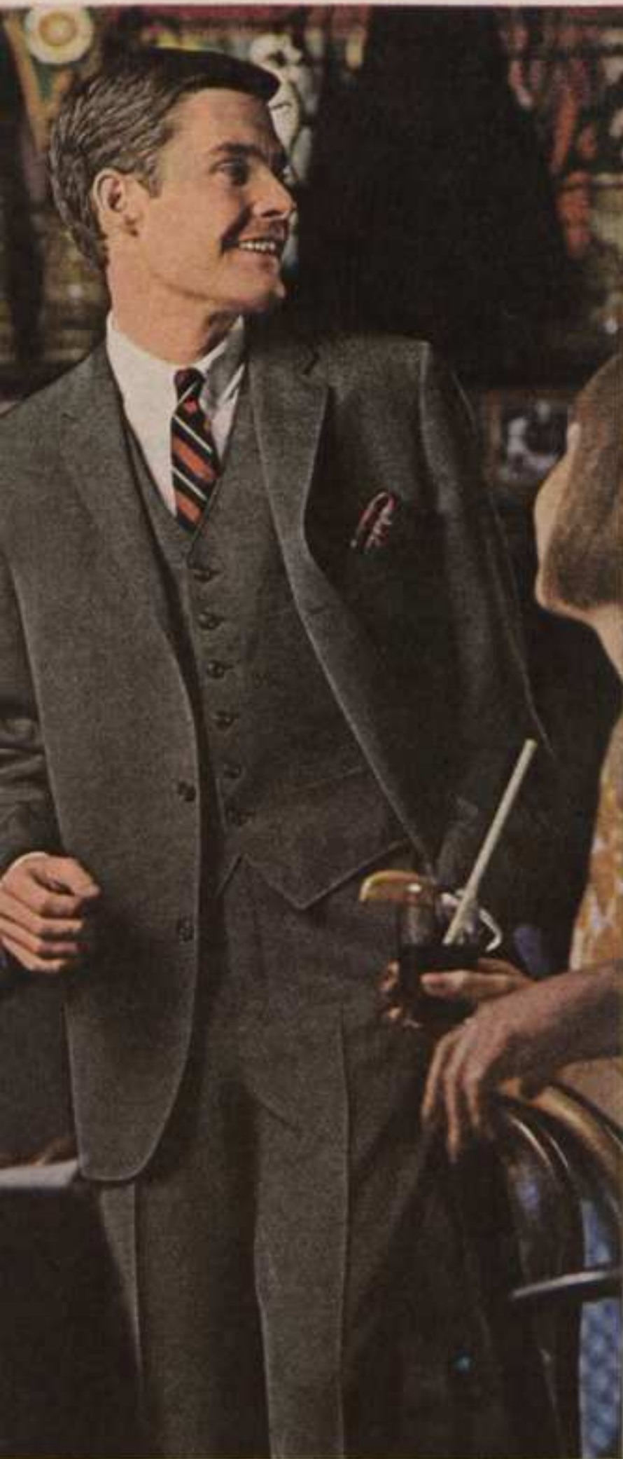
This new breed of whipcord is a press-holding blend of 55% "Dacron" polyester, 45% worsted wool. The suit: Blenron®, a classic natural-shoulder model. About $65. With vest, about $75.