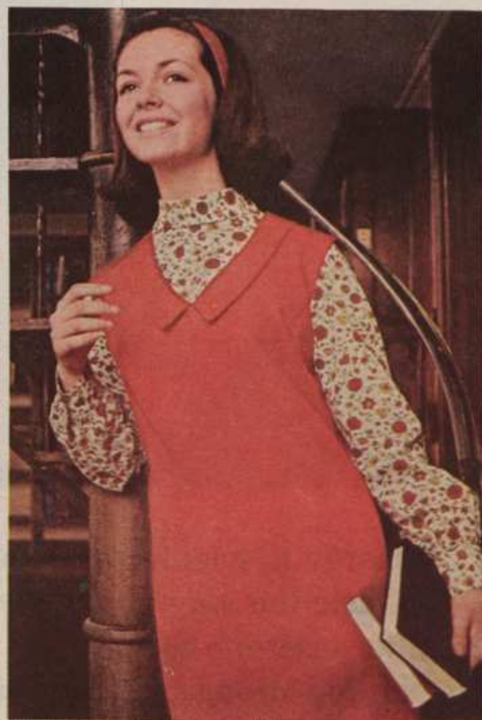
The two-in-one poplin jumper! To wear solo — or over brightly printed broadcloth. Smarteens does them in 65% "Dacron"® polyester, 35% combed cotton. Orange, brown or blue with color co-ordinated blouse. Sub-teen 6-14, about $15.