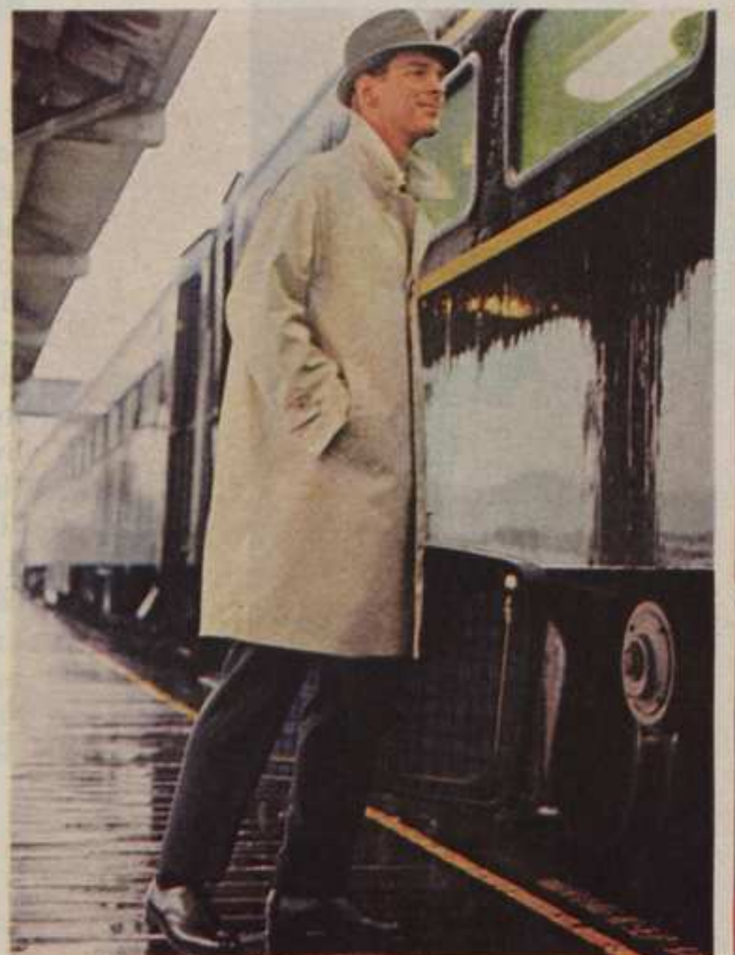
Rain or shine, this raglan raincoat by Gleneagles keeps its crisp good looks. 65% "Dacron" polyester, 35% combed cotton. Tan or black with tartan lining. About $39.95.