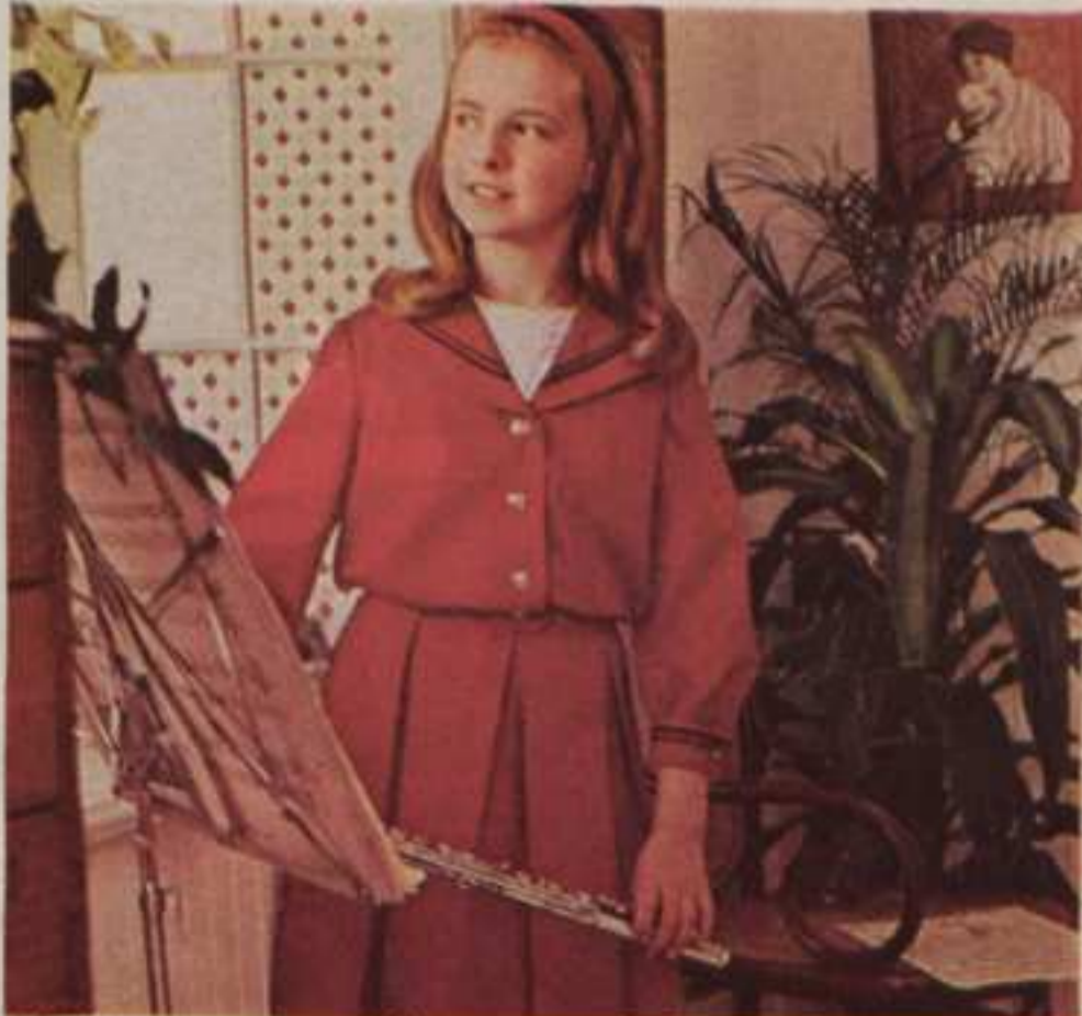
What every young girl loves — a rollicking red sailor dress with just a smidge of navy trim. Tiny Town Togs does it in a talented, tidy poplin of 65% "Dacron" polyester, 35% combed cotton. 4-6X, about $9. 7-14, about $11.