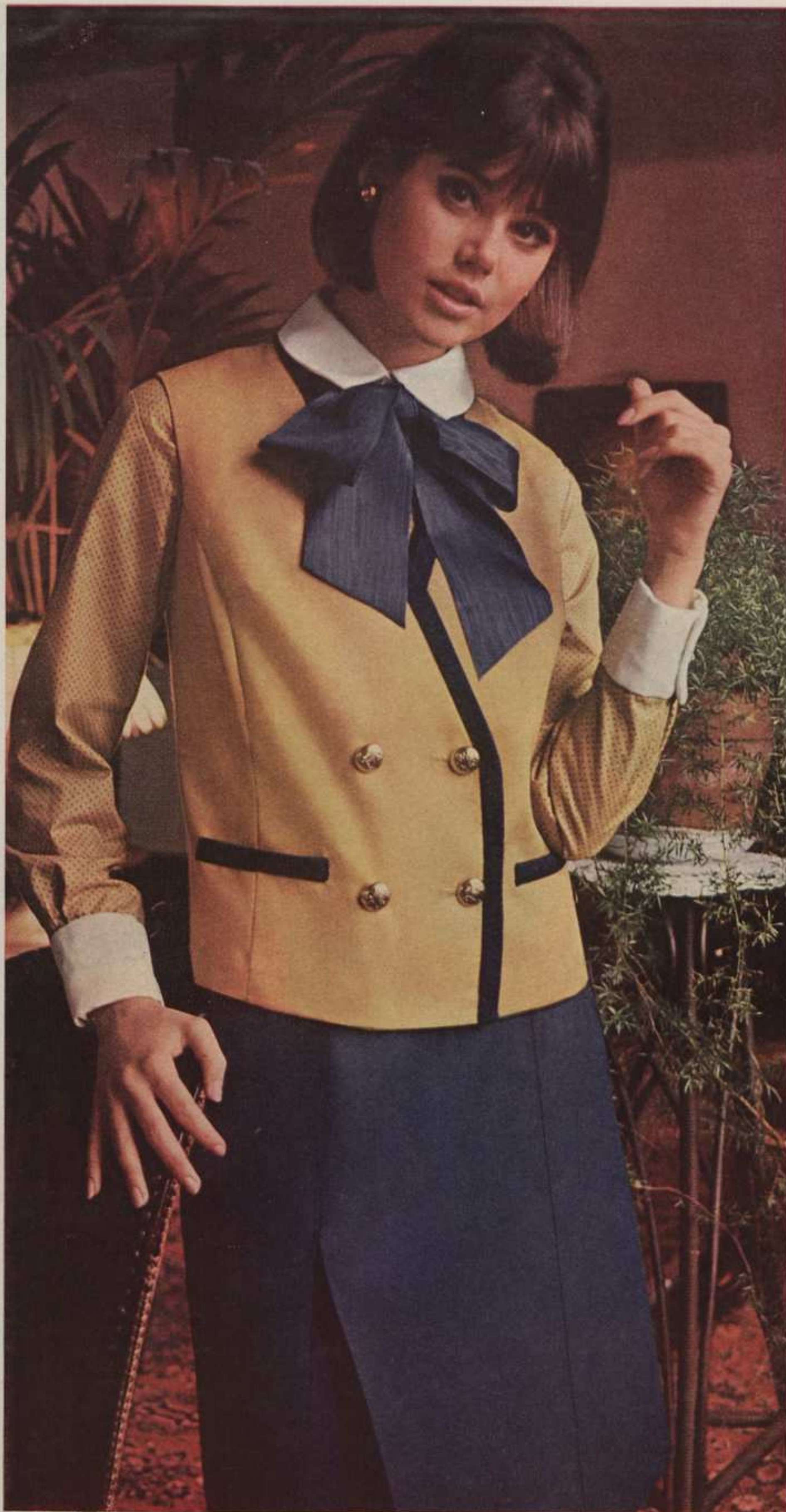
The Chanel influence in 65% "Dacron"® polyester, 35% combed cotton. A schoolboy blouse of batiste with vest and skirt of twill. By College-Town of Boston. Spiffy wash-and-wear, this! In curry/navy. 5-15, 6-18. Blouse, about $8. Vest, about $9. Skirt, about $10.