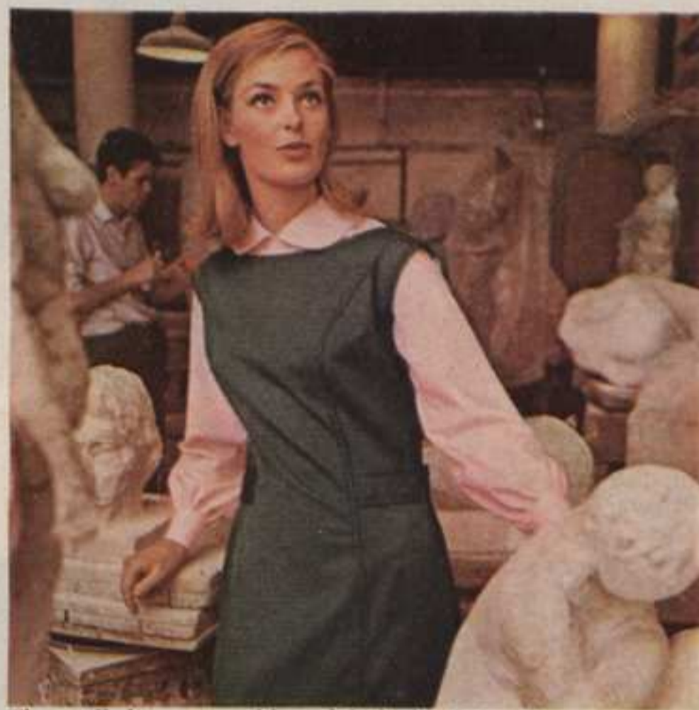
The twill skimmer and broadcloth shirt! Fresh beyond compare, in 65% "Dacron" polyester, 35% combed cotton. And beautifully wash and wear. By Catalina. Skimmer in hunter green, red, navy, black, oxford grey. About $11. Shirt in off-white, white, pink, blue. About $6. Both in 8-18.