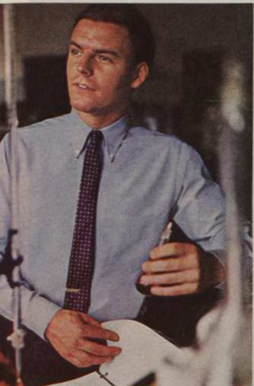
After a long day, this button-down still looks neat. Wash-wear oxford cloth of 65% "Dacron" polyester, 35% combed cotton by Gant, about $7.95. Tie of 100% "Dacron" polyester.

Go back to school with 'Dacron'... more styles, colors than ever before!