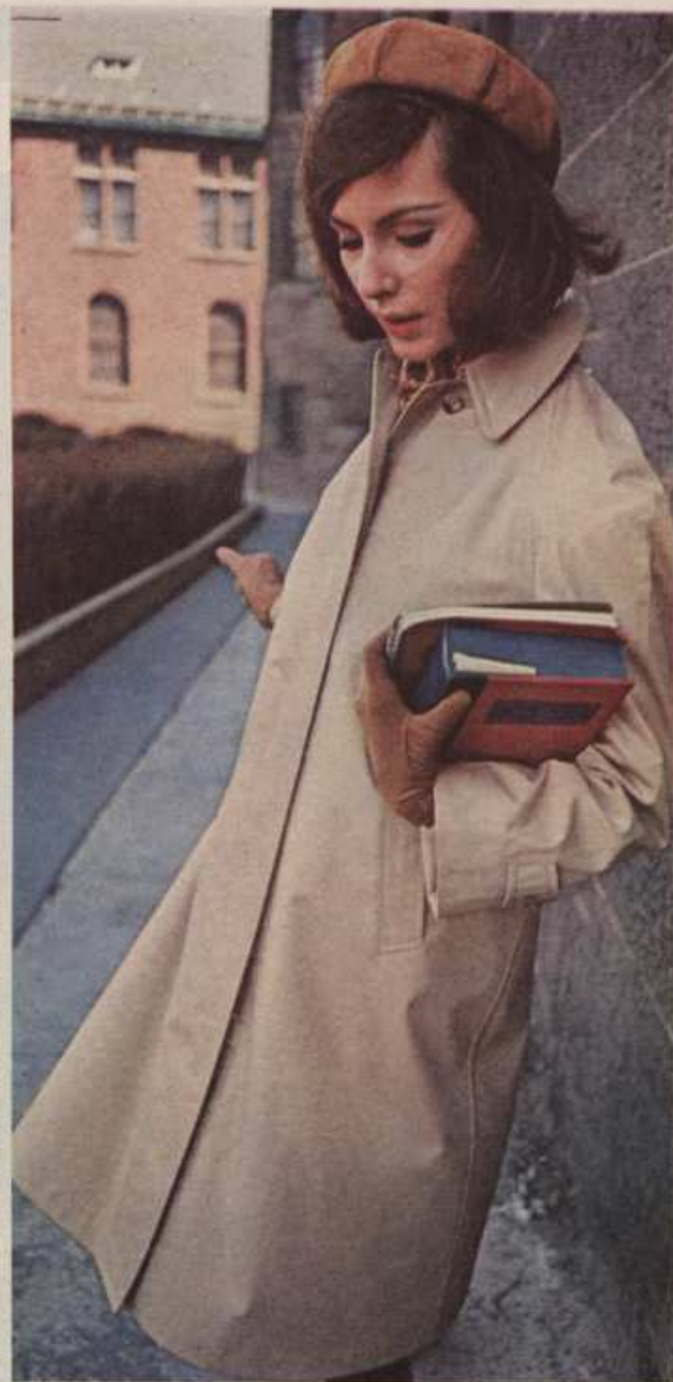
London Fog's "Duchess" raincoat in 65% "Dacron"® polyester, 35% combed cotton. Water-repellent poplin treated with "Zepel"® fabric fluoridizer. Machine-washable! Beige, grey, olive, black, burgundy, navy blue, ivory, copa blue, brown. 6-18 regular, 4-16 petite. About $35.