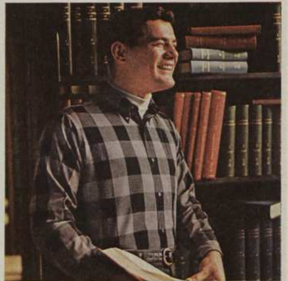
Lots of action won't wilt this Arrow sport shirt because it's 65% "Dacron" polyester, 35% combed cotton. Neatly tapered model with button-down collar. About $5.95.