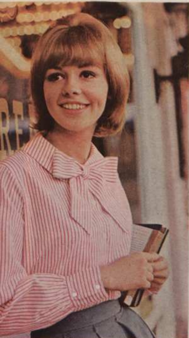
Crisp, clear, yarn-dye stripes in 80% "Dacron" polyester, 20% combed cotton. A blouse in any other fabric could never look like this and wash like this! By Ship 'n Shore. Red, blue, green or black stripes on white. 28-38. About $5.