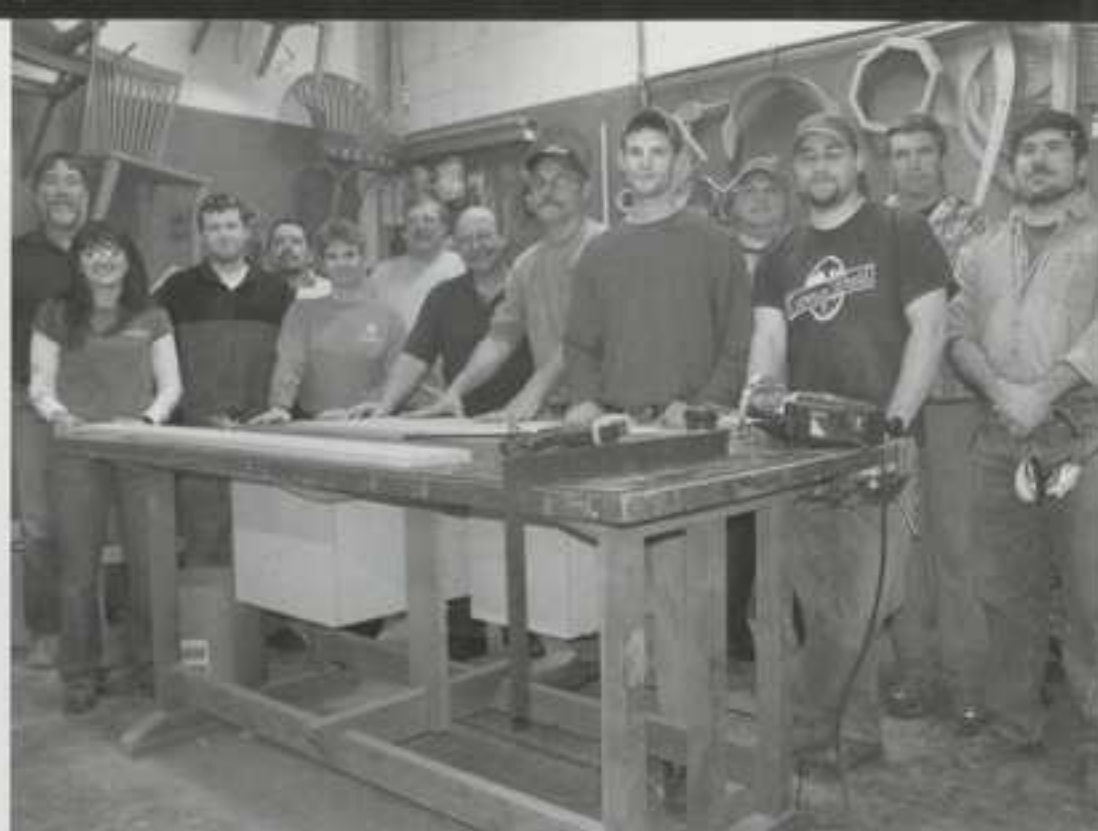
Some of our talented cabinetmakers gathered in our shop this past April.