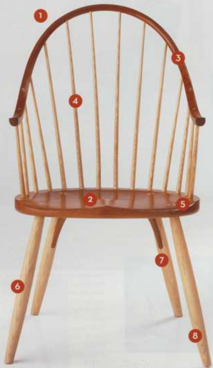
thos. moser continuous arm chair™ TMC $1325

8. DELIVERY: Clark & Reid, our delivery partner based out of Massachusetts, carefully blanket wraps each piece of furniture prior to loading it onto its truck on its way home to you.