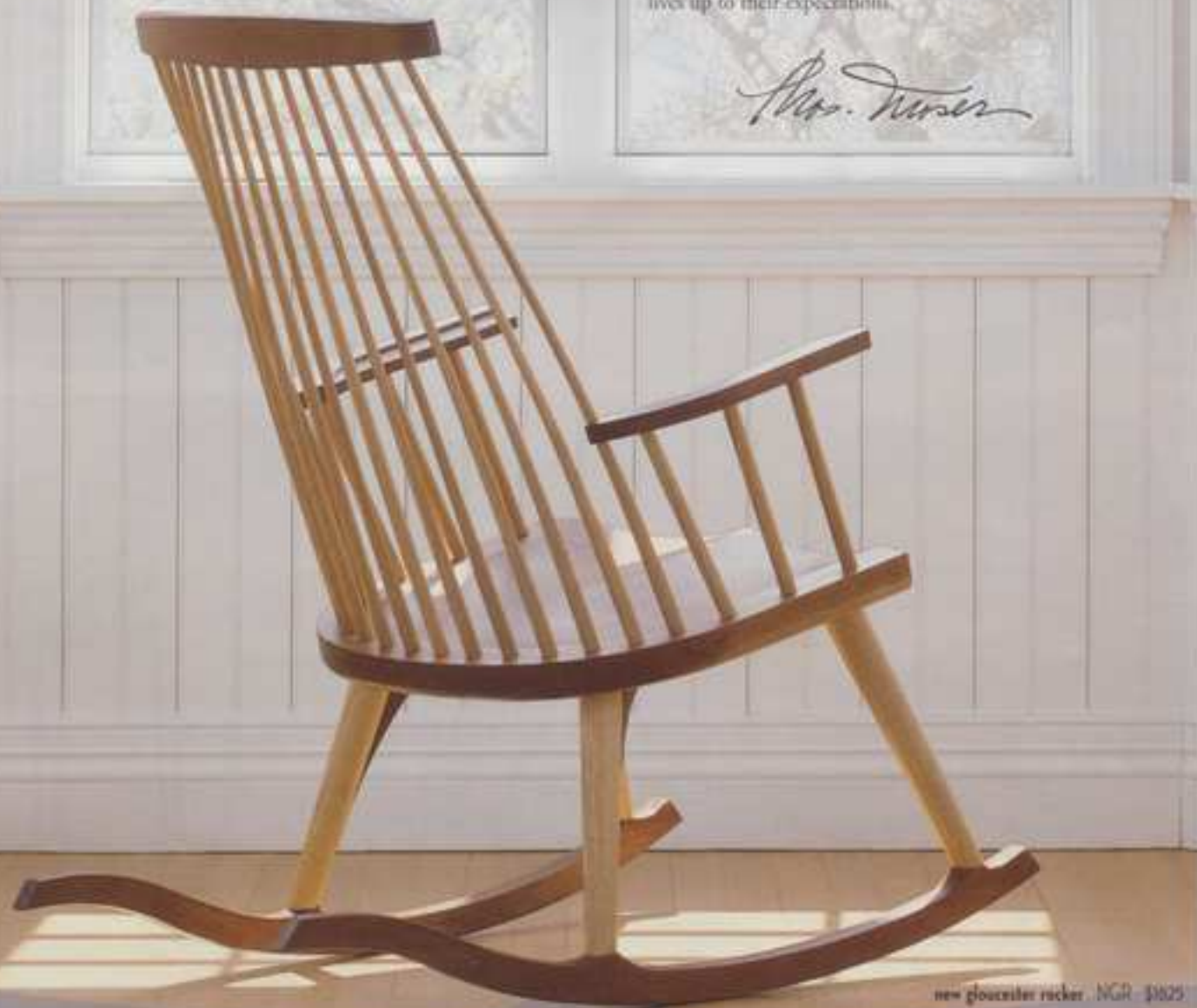
new gloucester rocker, NGR $1825

MOST FURNITURE IN AMERICA TODAY IS MANUFACTURED OFF SHORE OFTEN TRAVELING AS MUCH AS 26,000 MILES BEFORE LANDING IN HOMES. THOS. MOSER'S RESOURCE CENTER FOR ALL OF THE ELEMENTS NEEDED TO MAKE OUR FURNITURE AVERAGES 350 MILES FROM OUR SHOP IN MAINE.