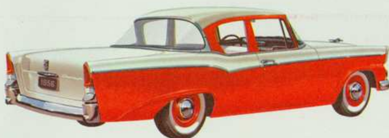
CHAMPION 2-DOOR SEDAN