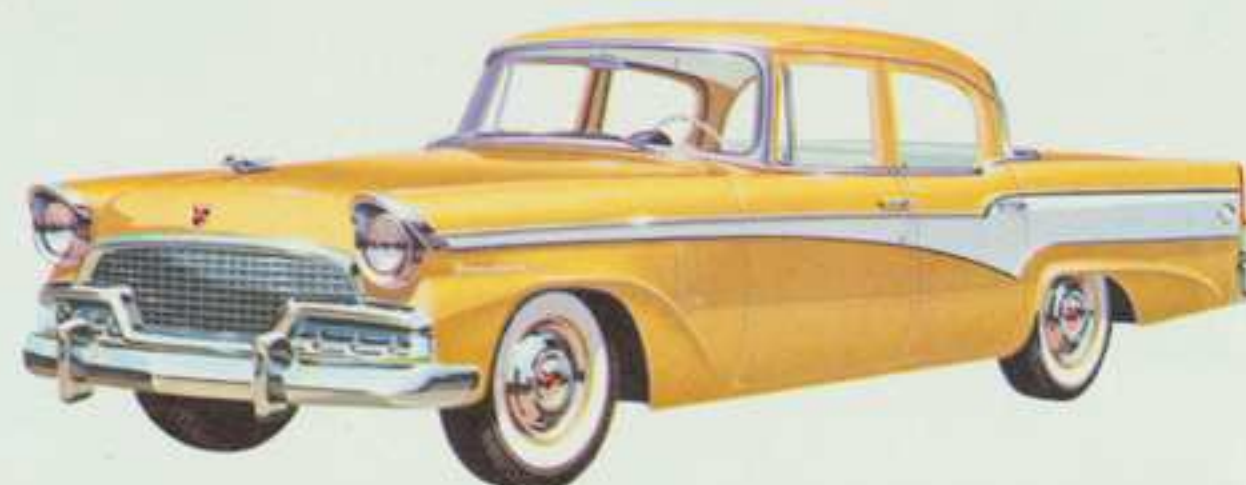
PRESIDENT 4-DOOR SEDAN