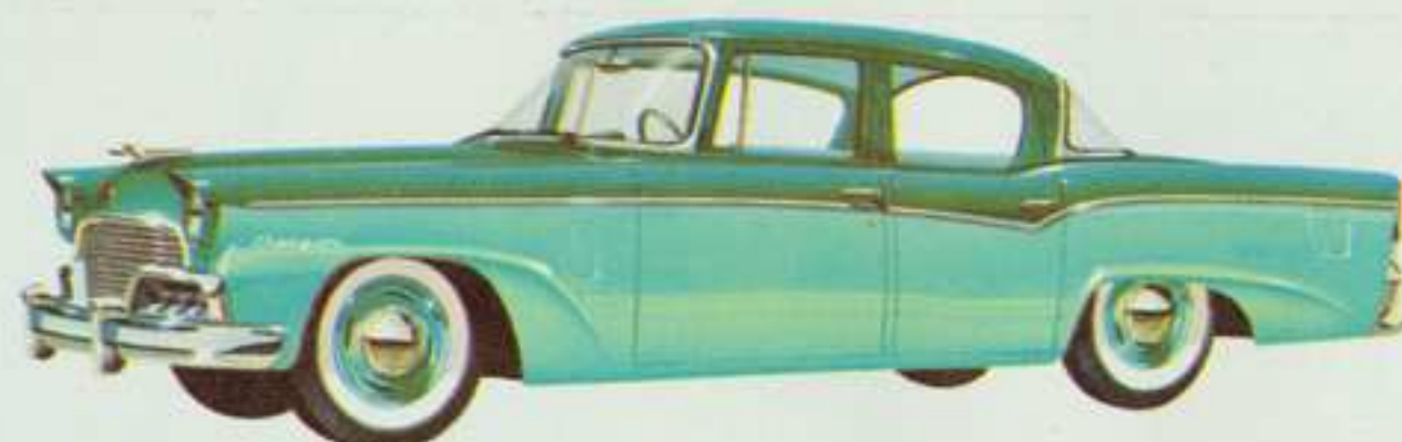
CHAMPION 4-DOOR SEDAN