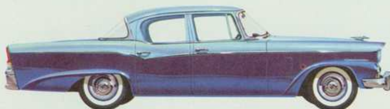
COMMANDER 4-DOOR SEDAN