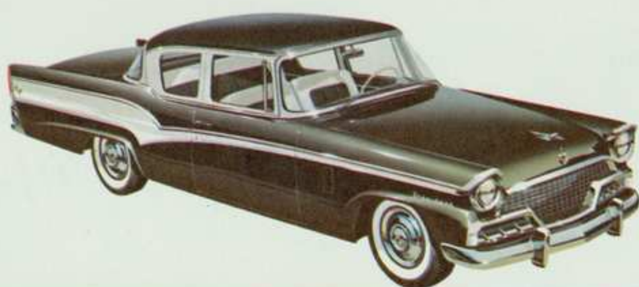
PRESIDENT 2-DOOR SEDAN