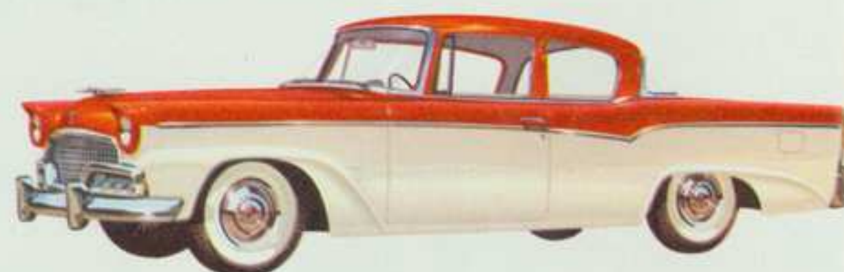
COMMANDER 2-DOOR SEDAN